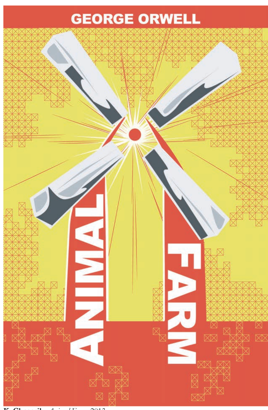
One of the most important symbolic elements of George Orwell's book Animal Farm is the windmill that the pigs force the animals to build and then blame its ultimate destruction on Snowball. Using the windmill as the main focal point of the cover, I wanted to invoke constructivist style of art in a post-modern way.