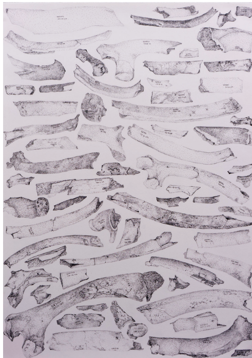
Repose No. 2 (Rib Fragments)