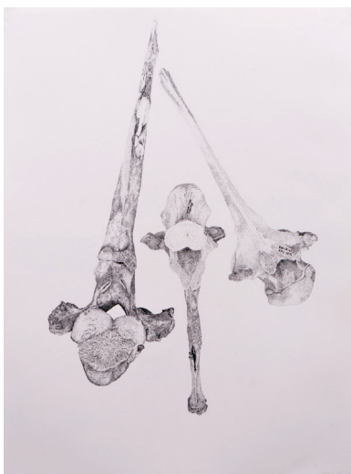
Repose No. 3 (Thoracic Vertebrae)