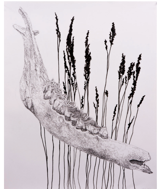
Repose No. 4 (Dentary)